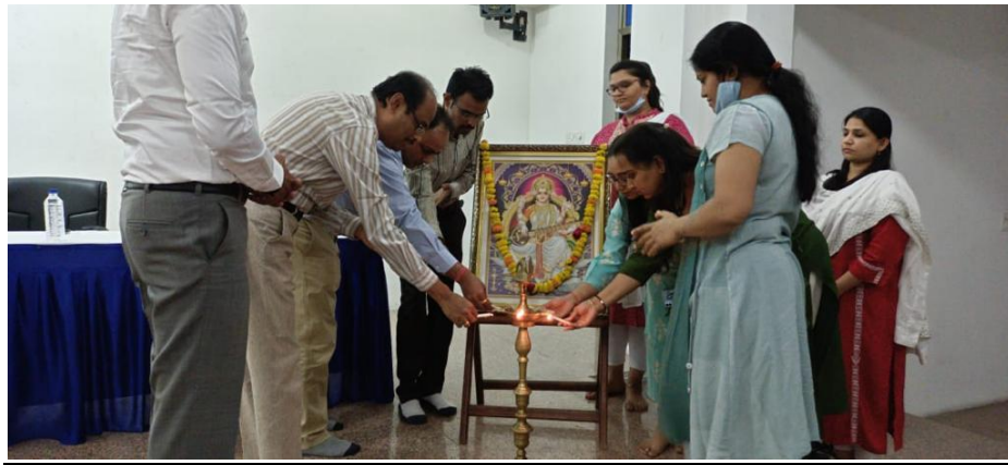
Lamp Lightining Ceremony for Prize Distribution