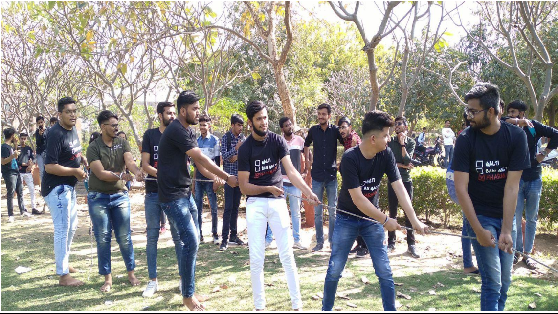
War of Tug