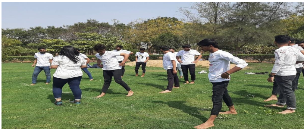
Capture the Flag