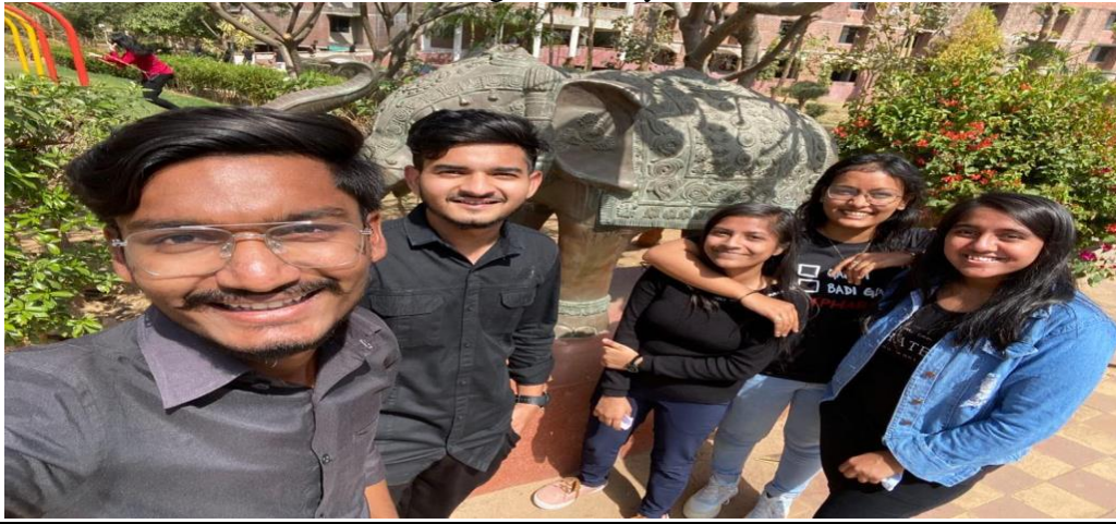
Twinning & Group Day