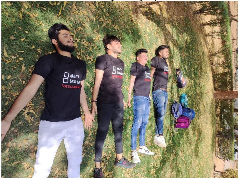
Twinning & Group Day