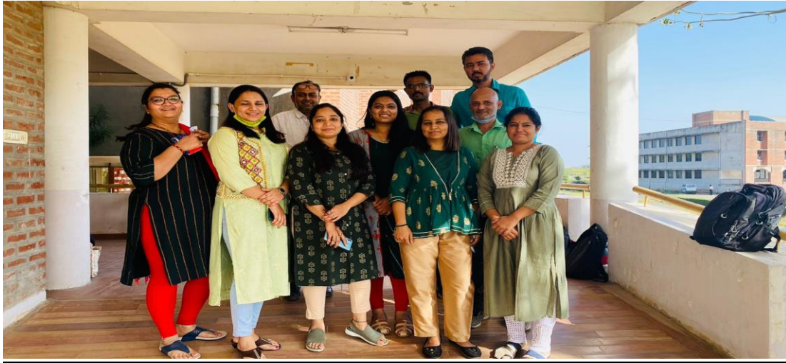
Fun Week Staff Team